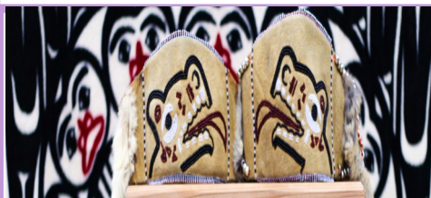
King and Queen's Set of Crowns Used in the 'Passing of the Crowns Ceremony'